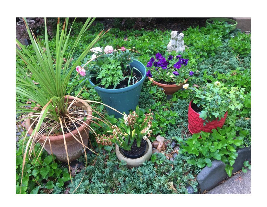
Practice: Can you count the flower pots?